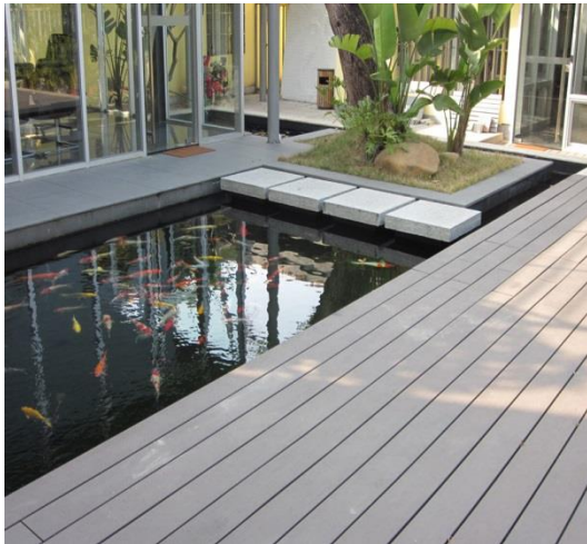
Private Residential Koi Deck

NOW .....Call us for presentation, samples & catalog.